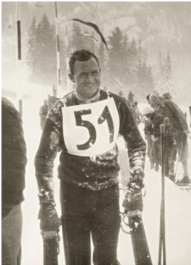
The author's grandfather, who competed in the 1932 Games.