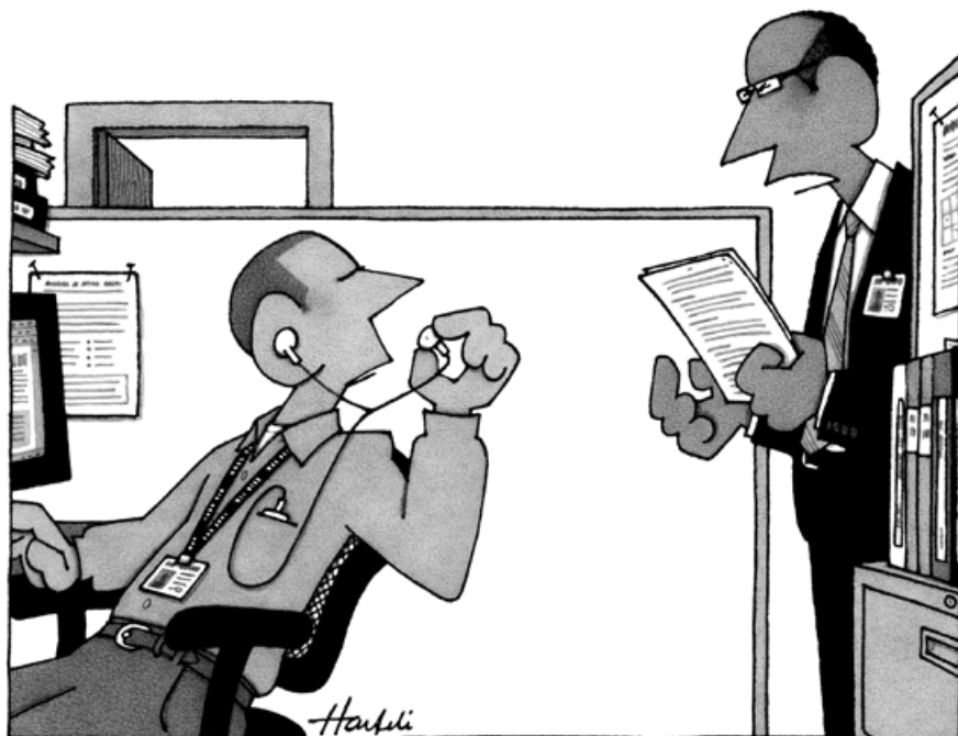
"This requires both ears."