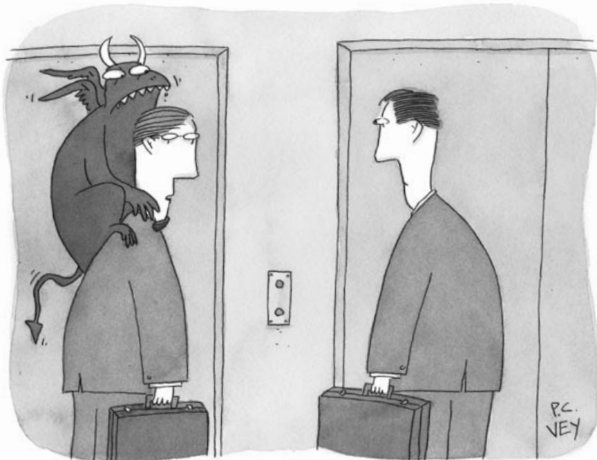
"It came with the job."

The Lake Placid Club was unapologetically exclusionary. It did not allow Jews or blacks. Perhaps appropriately, the following Winter Olympics, in 1936, was held in Nazi Germany, in Garmisch-Partenkirchen, as a hibernal companion to the Berlin Games. It was the first Olympics, as it happens, to have Alpine racing. Arnold Lunn had lobbied for years for his innovations to be included in the Games, but he urged skiers to boycott Garmisch, because of the Nazis. Avery Brundage, the long-time and now infamously retrograde