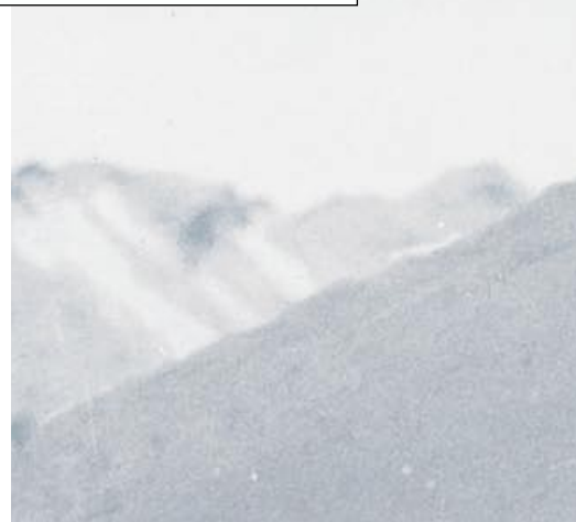
Left: Norway's Aksel Lund Svindal in the giant